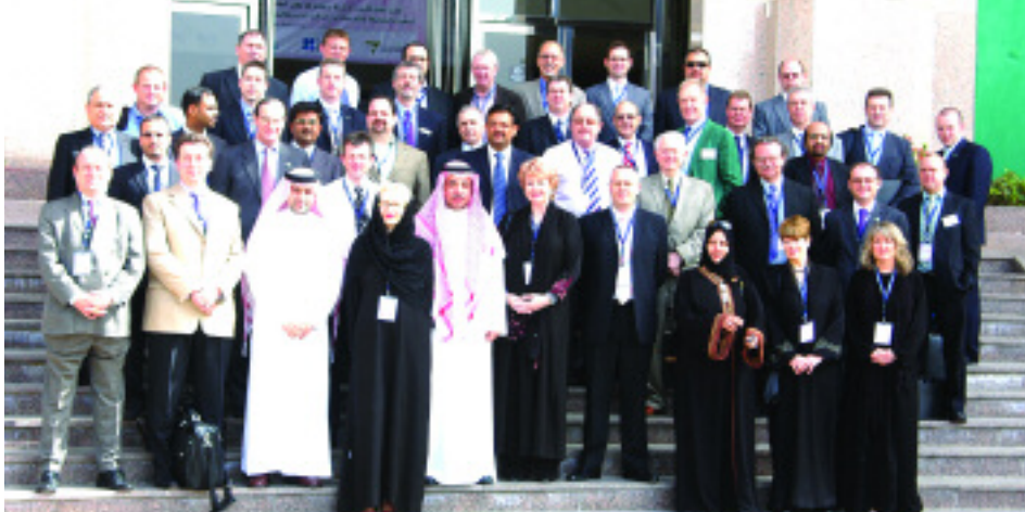
British delegation at the Saudi Arabian Chamber of Commerce, Dammam, Eastern Province, including representatives from BiP's Commercial team.

The meetings with the Saudi Government coincided with Saudi-British week (18-23 April). This gave the BiP team the opportunity to attend a number of events planned by Scottish Development