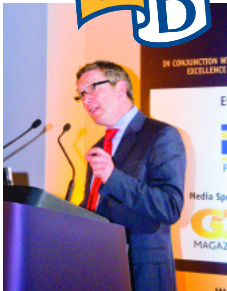
Minister for the Third Sector Phil Hope addresses delegates at N3PD 2008

He added: "We do not want to see suppliers squeezed, which simply has the effect of driving firms out of the market, reducing competition and choice. Nor do we want to see a return to the bad old days of compulsory competitive tendering, when price, and not value, was all that mattered."