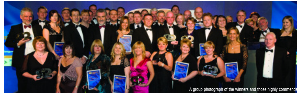
A group photograph of the winners and those highly commended