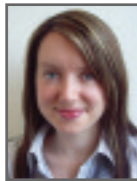
By Morven MacNeil, GO Features Editor