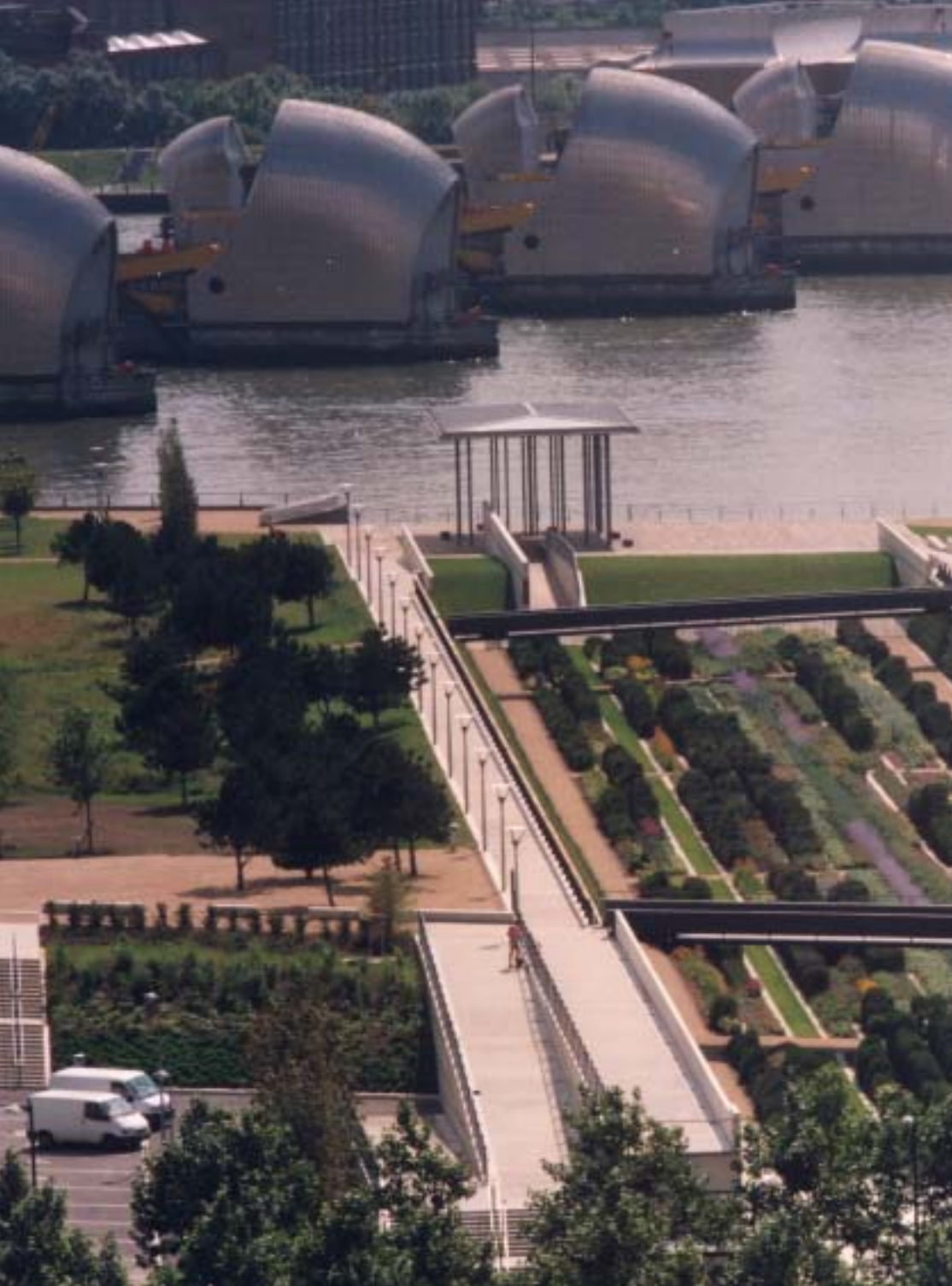
Thames Barrier Park