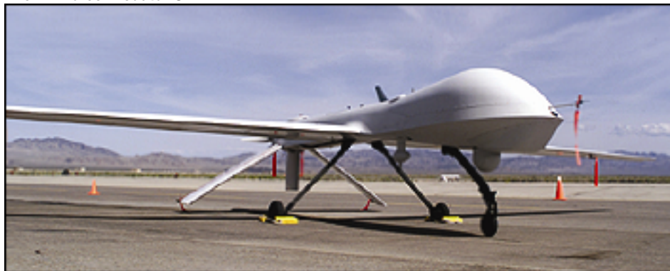
The Air Force Predator UAV