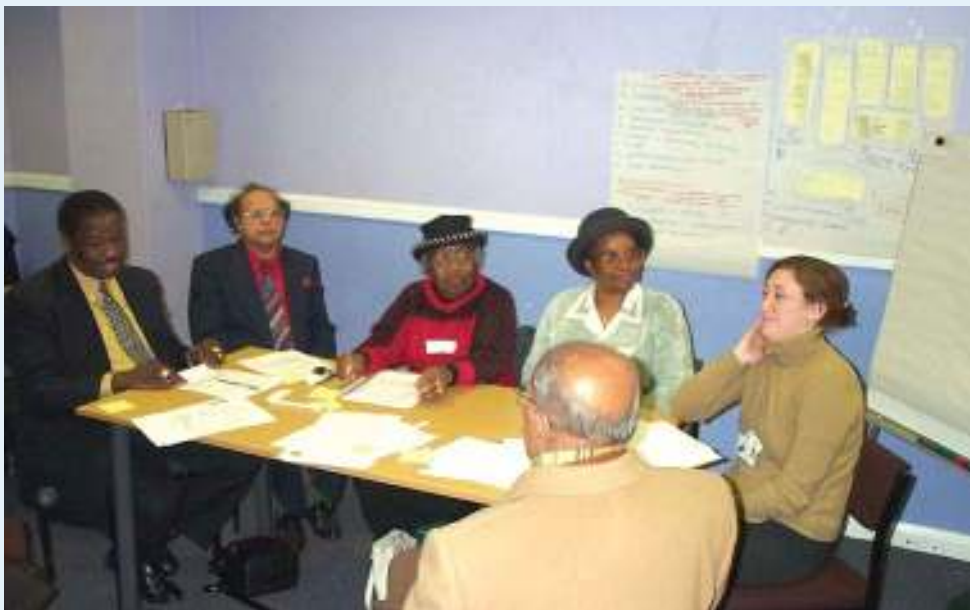
One of the Lambeth meetings

Southwark, Lambeth, Newham and Hammersmith & Fulham Councils and the Government Office for London encourage participation of ethnic minority communities in regeneration and sustainable development activities