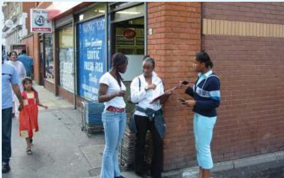
Peckham Youth Forum researching food retailing accessibility.