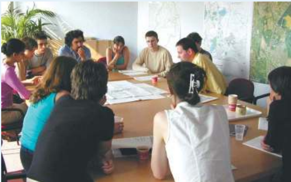
Youth Focus Group in Action

Encouraged young people to train in planning and architecture