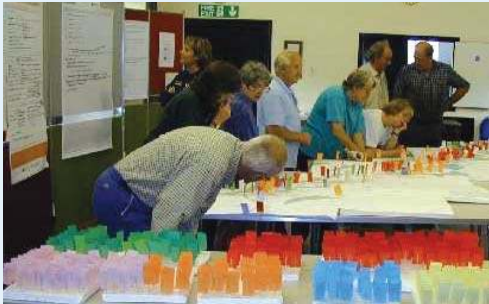
Involving a cross-section of the Exmoor community with ‘Planning for Real’

Gave the evidence base for new policies, including a major shift in housing provision