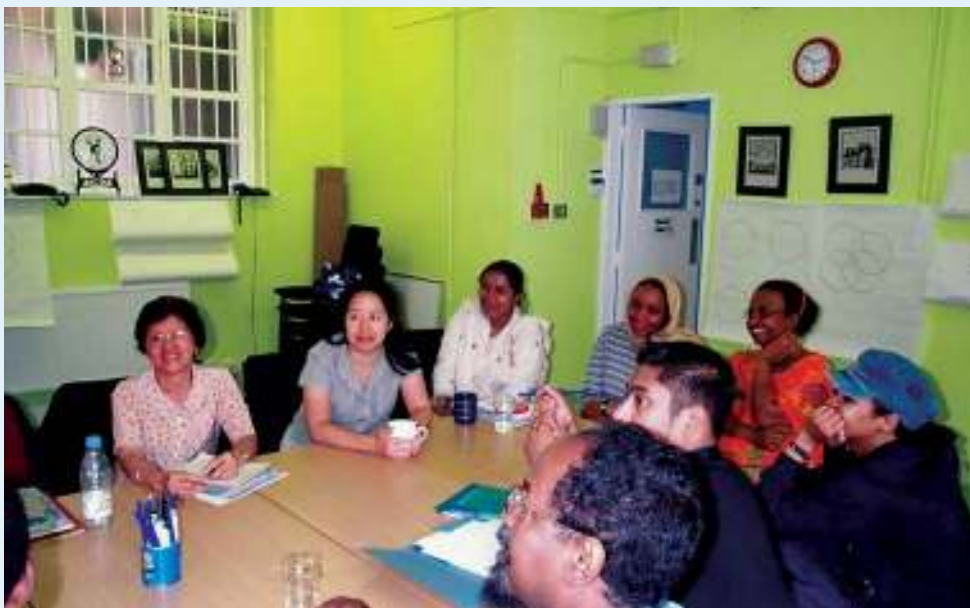
Community facilitators' training

Training initiatives and implementation mechanisms