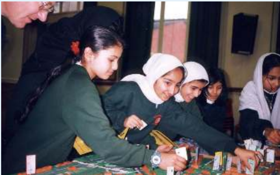
Consultation at local high school using model.

Community Technical Aid Centre effectively identifies and targets diverse groups in the community planning exercises in an inner city area.