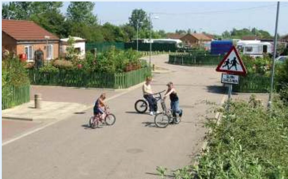
A typical Fenland Gypsy and Travellers' site.

Positive action to promote social inclusion through consultation, criteria-based policies, monitoring, training and liaison