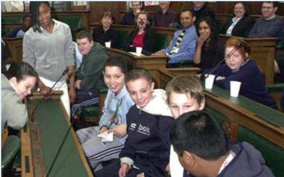
Youth Planning Symposium, Camden Council Chamber 2004

Making planning, including development control procedures, more user-friendly to increase participation in Camden