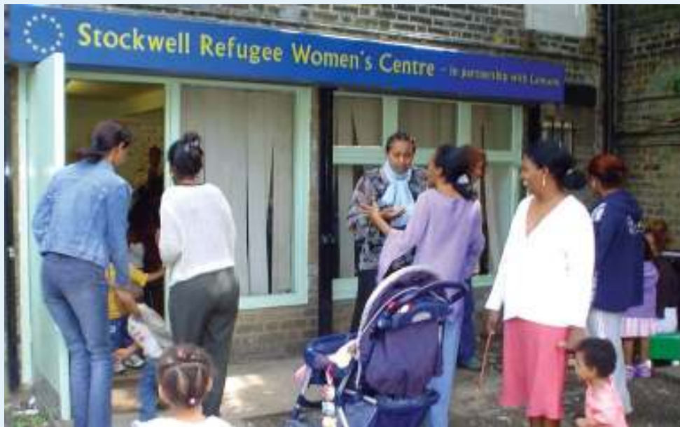
The Stockwell Refugee Women's Centre was launched, meeting a defined need in the area

Mainstreaming community participation developed into a Masterplan and success in funding projects