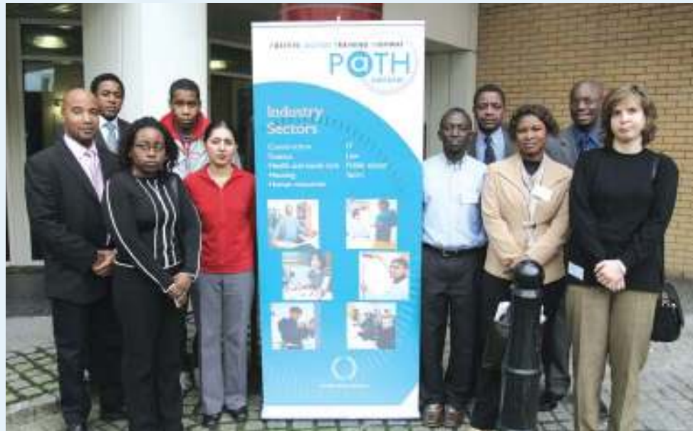
Tomorrow's Planners Launch

10 year programme facilitating the entry of people from ethnic minorities to planning to address low representation