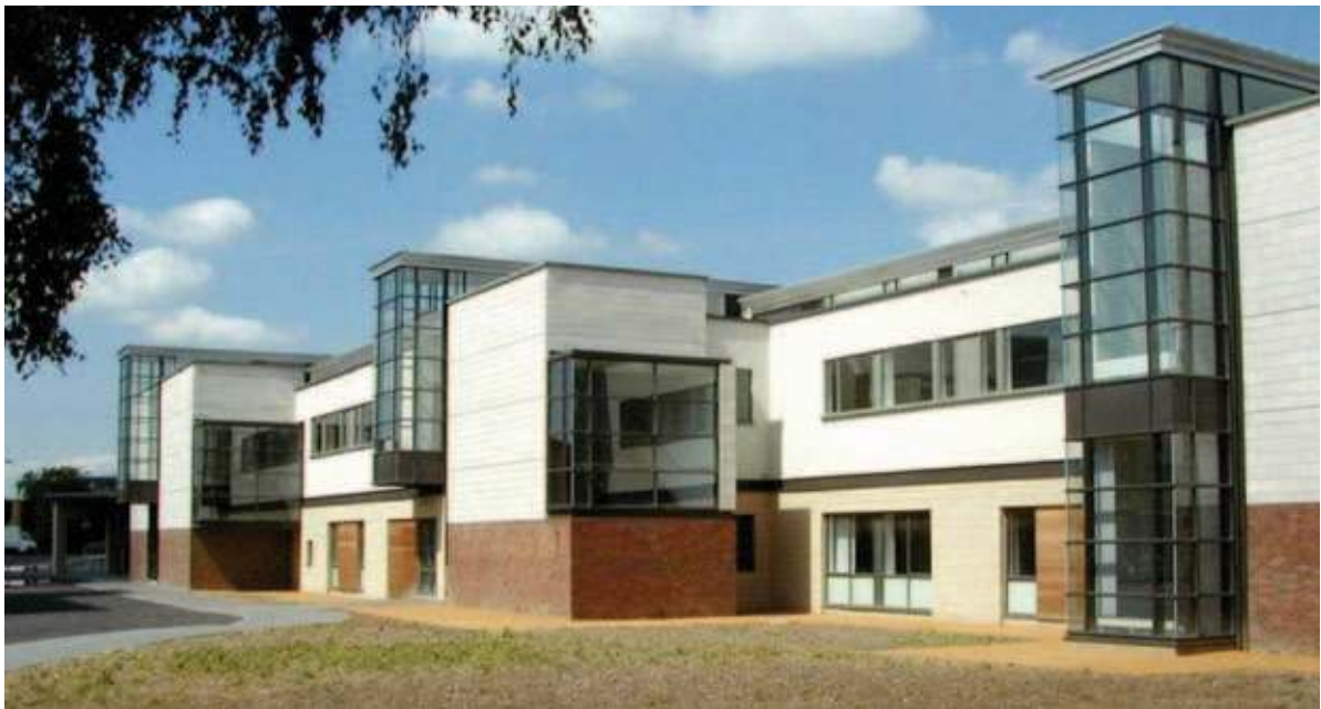
Central Middlesex ACAD, North West London