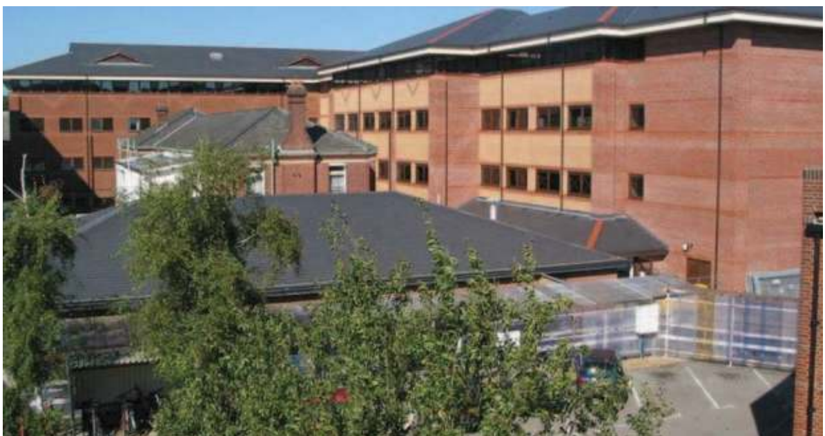
South West London Elective Orthopaedic Centre