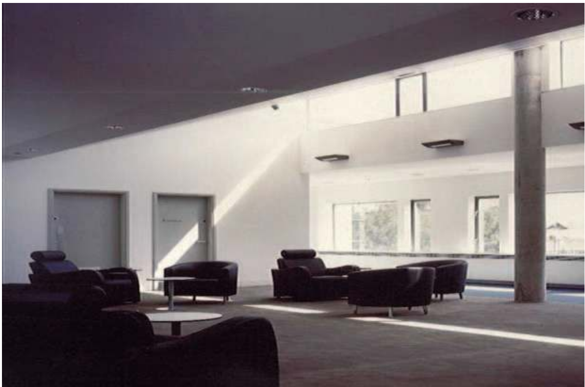
Patient Lounge at ACAD, North West London