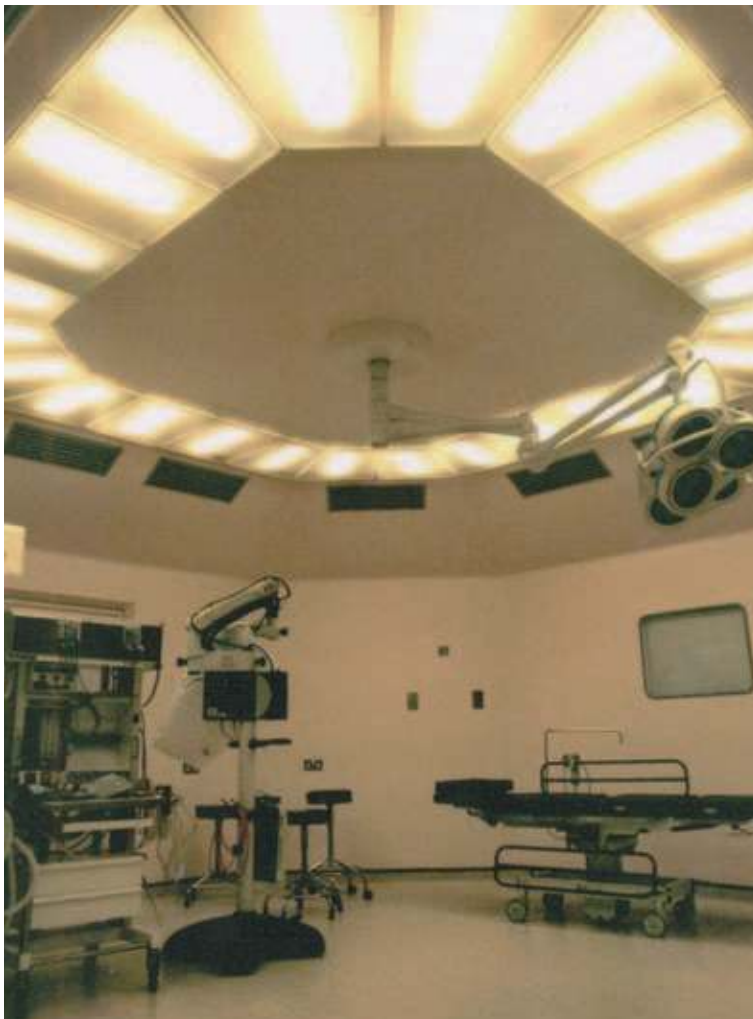
Theatre at Moorfields Eye Hospital, London