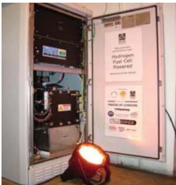
Arcola's hydrogen fuel cell

In February 2008 we installed a 5kW IdaTech ElectraGen™ Fuel Cell System to power our cafe/bar and Studio 1 lighting. The fuel cell runs on hydrogen and the system generates 50V DC which is converted to 240V AC by an inverter.