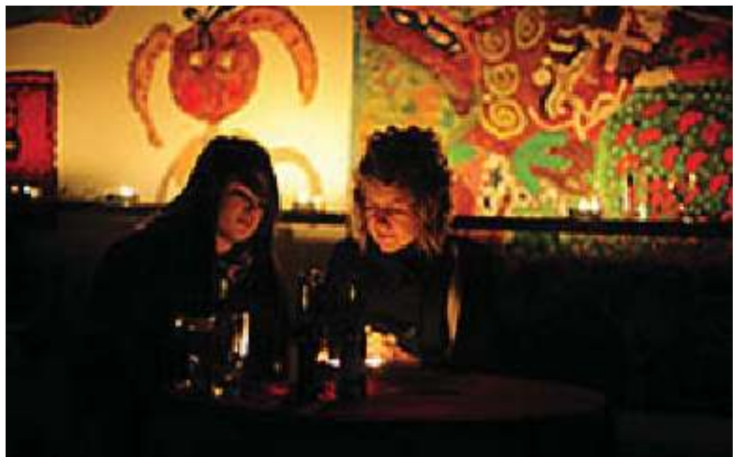
Revellers at Power Down III, 15 December 2007