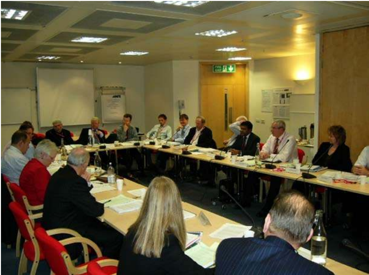
The Committee in session.

The Department of Finance and Personnel, Northern Ireland