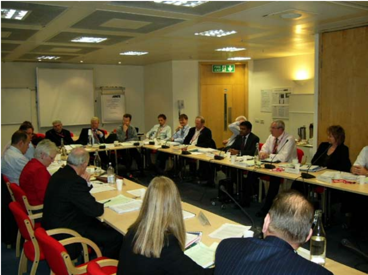
The Committee in session.

The Department of Finance and Personnel, Northern Ireland