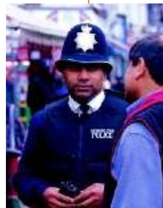
Sir Ronnie Flanagan GBE QPM

The report should very much be interpreted as interim. While I have been pleased at the extensive response to our published request for contributions to the Review, there remains much to be done. I am particularly anxious to engage in much wider public consultation as the work progresses. I am deeply indebted to the many people and organisations giving me so much time and effort in this work and they will of course be properly acknowledged in the final report which I hope to submit early next year.