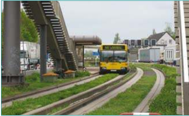
Guided Busway, Essen, Germany