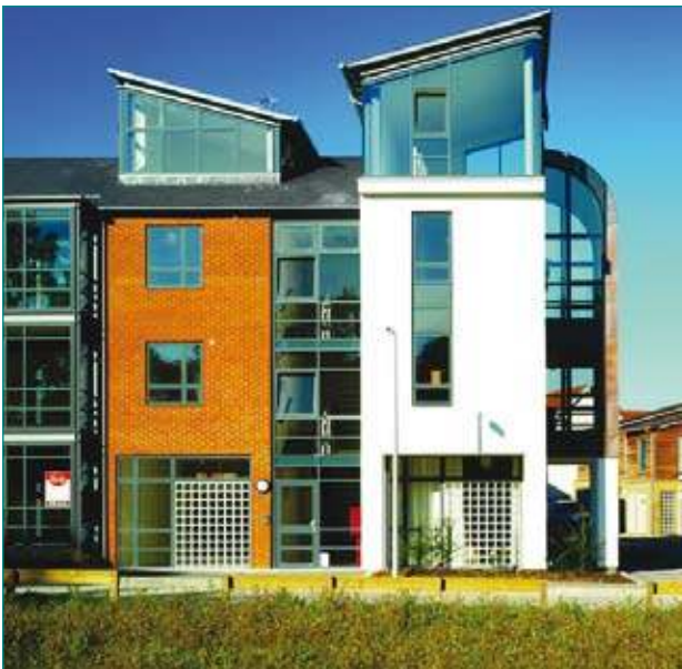
Cala Domus, Newball