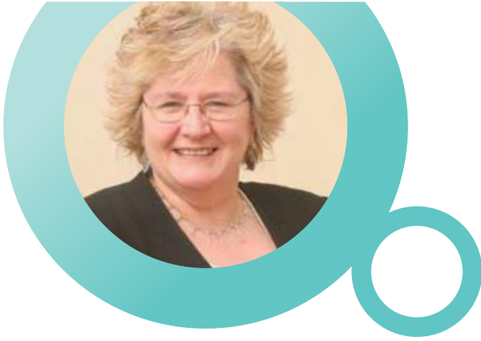
Pictured: Anne McGuire Minister for Disabled People