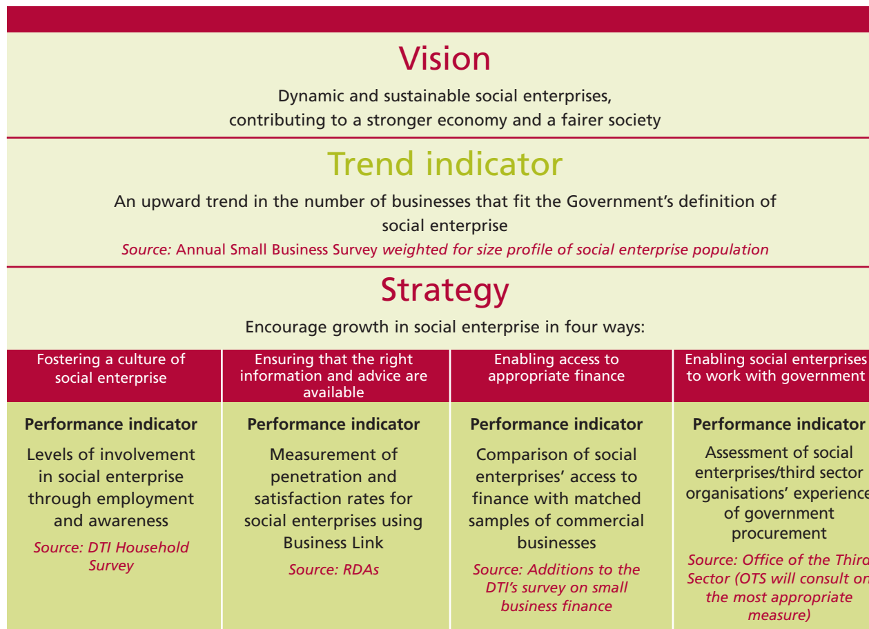
Figure 2: Performance indicators

160 The four themes outlined in this document contain strands of work to move forward towards the vision of dynamic and sustainable social enterprises, contributing to a stronger economy and a fairer society. Each has a performance indicator (figure 2).