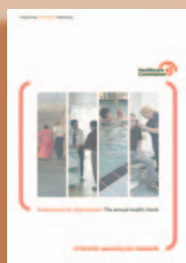
*Criteria for assessing core standards The standards are outlined in these documents