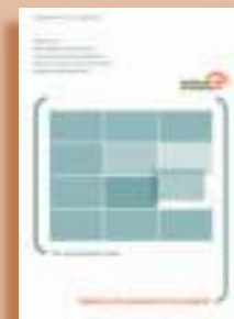
Guidance for assessing core standards

*These are available for PCTs, ambulance services, acute services and mental health and learning disability services