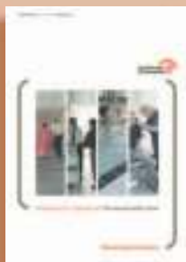
Annual health check

There are a number of guides, outlined below, that have been produced, explaining the annual health check. If you need a copy of any of these please contact the Healthcare Commission on 0845 601 3012 or e-mail feedback@healthcarecommission.org.uk