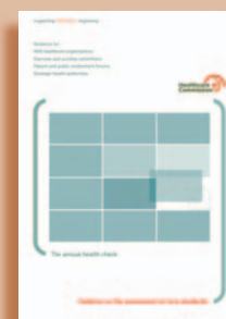
Guidance for assessing core standards