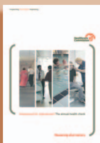
Annual health check

There are a number of guides, outlined below, that have been produced, explaining the annual health check. If you need a copy of any of these please contact the Healthcare Commission on 0845 601 3012 or e-mail feedback@healthcarecommission.org.uk