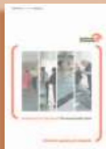
*Criteria for assessing core standards The standards are outlined in these documents