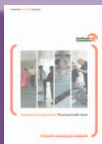
*Criteria for assessing core standards The standards are outlined in these documents