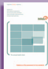
Guidance for assessing core standards

*These are available for PCT's, ambulance services, acute services and mental health and learning disability services