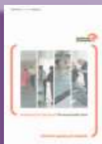
*Criteria for assessing core standards The standards are outlined in these documents