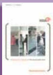
Annual health check

There are a number of guides, outlined below, that have been produced, explaining the annual health check. If you need a copy of any of these please contact the Healthcare Commission on 0845 601 3012 or e-mail feedback@healthcarecommission.org.uk