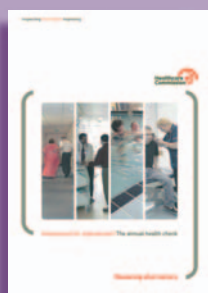
Annual health check

There are a number of guides, outlined below, that have been produced, explaining the annual health check. If you need a copy of any of these please contact the Healthcare Commission on 0845 601 3012 or e-mail feedback@healthcarecommission.org.uk