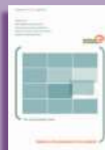
Guidance for assessing core standards

*These are available for PCT's, ambulance services, acute services and mental health and learning disability services