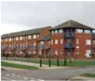
New three-storey flats

The combined result of the reduction of housing units has been a reduction in density, from 25 to 21 dwellings per hectare (based on the masterplan's figure of 200 hectares as the size of the neighbourhood), or from 20 to 17 (according to the Trust's figure of 2.5 square kilometres). The average density, therefore, is far below the minimum density of 30 dwellings per hectare that is the current national recommendation. This recommended figure equates to 12 per acre, that is, the traditional suburban density in the UK, and is itself far below the average 20 per acre that terraced housing provided. Low densities, however, have not resulted in larger homes. As some residents complain, the old houses were built to Parker Morris standards, and so were typically larger than the new ones. The attempts to achieve higher densities, such as the three-storey flats, are seen as difficult to use by the elderly for moving furniture in the absence of a lift.