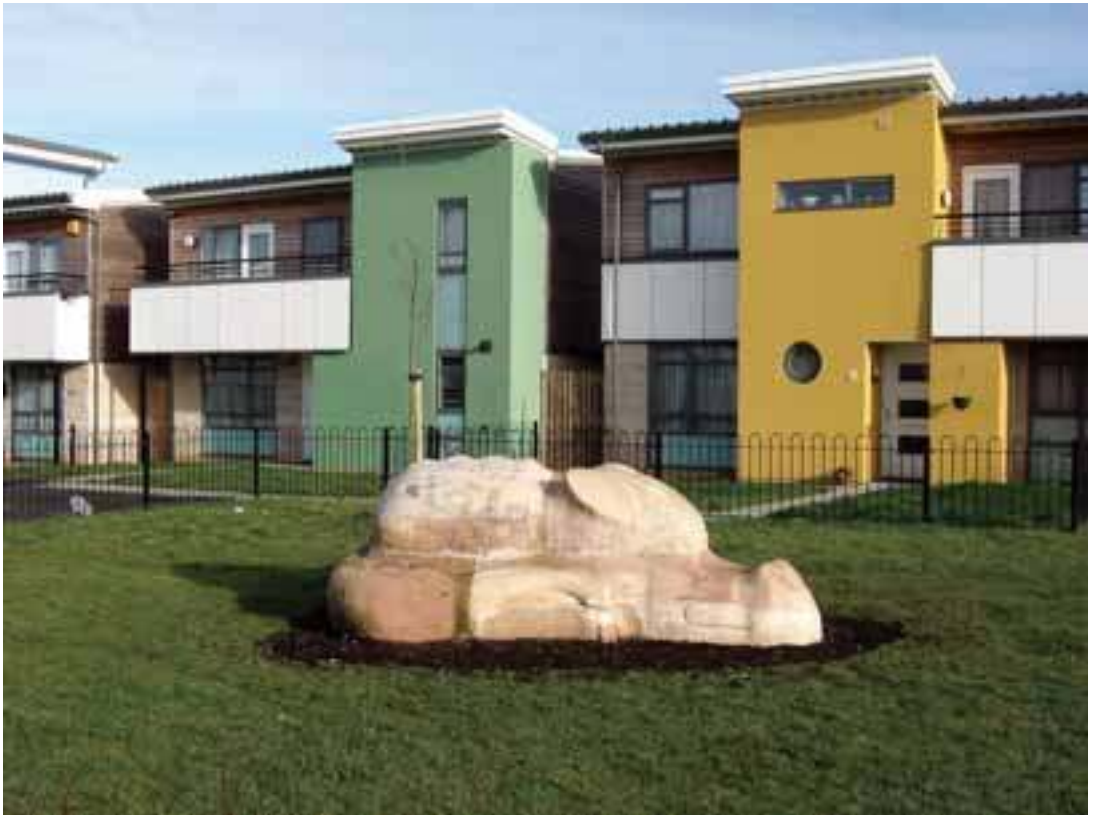
Farnborough Road's new housing development

new building forms. For example, the new buildings on Farnborough Road seem too controversial in style and not matching the rest of the area's newly acquired air of normalcy; as one resident puts it, "it is an architect's dream and a resident's nightmare". Would, for example, a normal suburban housing estate include bright-coloured buildings and strange-looking public art objects? In this sense, avoiding distinction is a conservative tendency also found in other suburban neighbourhoods. The fear of standing out, and subsequently being found out as vulnerable, is hidden deep down in people's memories. The fear of being experimented upon, rather than being given what the better off routinely get, generates nervousness.