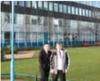
Castle Vale School

By using the case study of Castle Vale, the report searches for some answers to a more general question as to whether and how physical improvement can be a driver for socio-economic improvement in a neighbourhood.