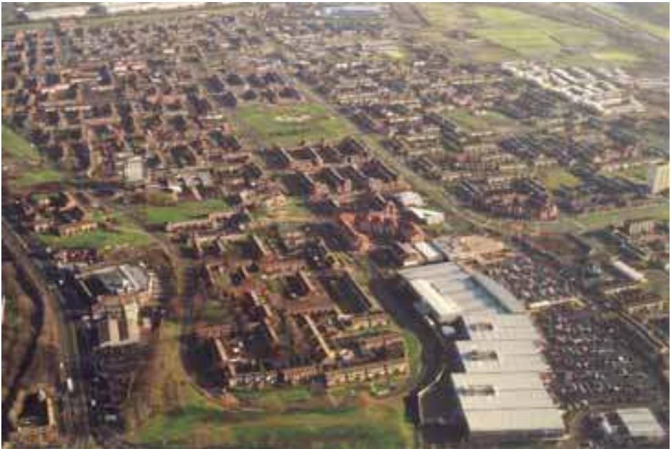
Castle Vale in 2004