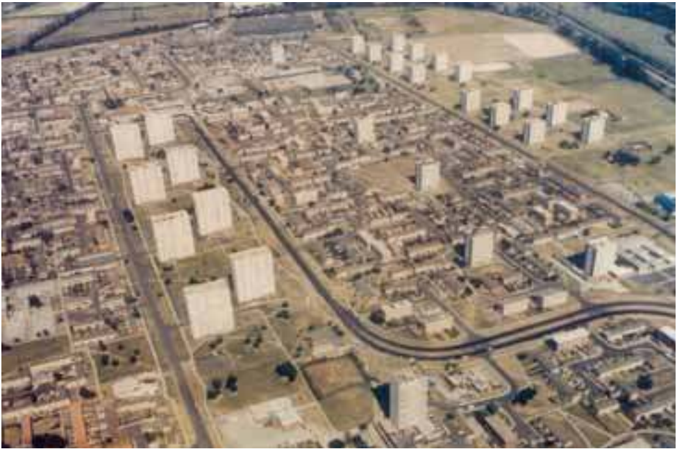
Castle Vale in the early 1990s