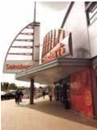
New Sainsbury's supermarket

The development of the retail park, particularly Sainsbury’s supermarket, has been a major turning point in the neighbourhood’s story. It provided access to daily goods, which is so often lacking in deprived neighbourhoods, as they are avoided by retailers for fear of crime and lack of customers. By the establishment of Sainsbury’s, confidence in the future of the area grew among the residents and others in the city. It could now attract shoppers from the surrounding areas, and establish Castle Vale as a significant suburban centre. Though the supermarket may be too expensive for some residents, they appreciate the change from the old, dangerous and dilapidated centre.