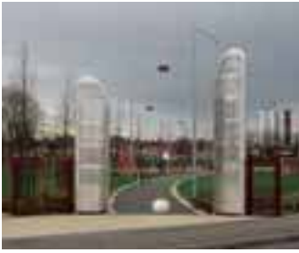
The Central Park

open spaces should in principle be treated with caution, especially when converted to private property; though in Castle Vale the very low densities and vast tracts of open space make some adjustments affordable. Furthermore, new open space has been developed, notably the Central Park, a completely new park praised by residents and outsiders. In parallel, smaller parks and playgrounds around the neighbourhood have been improved. Now residents say they feel free to walk in the streets at night without fear of criminal gangs, who dominated the neighbourhood in the past.