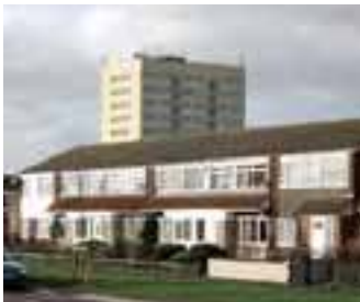
One of two remaining towers

The impact of very low densities is clearly felt in the neighbourhood's space. Some new spaces, such as the second neighbourhood centre, have an urban feel through better proportions between the height of buildings and the