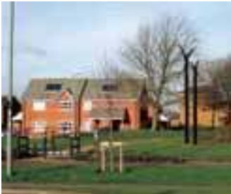
Low-rise, suburban housing in Castle Vale

Two features have changed the character of the neighbourhood: low-rise, low-density housing and a retail park. This change has removed the stigma and appears to be making the neighbourhood similar to other suburban areas, which is satisfying the residents, despite all the aesthetic, social and environmental problems associated with suburbs. Creating a successful suburb was indeed part of the original vision of regeneration. As the Trust’s Chairman reports: “Eleven years ago I had a vision that one day Castle Vale would become a suburb of which not only its residents, but also Birmingham, would be proud.” 10